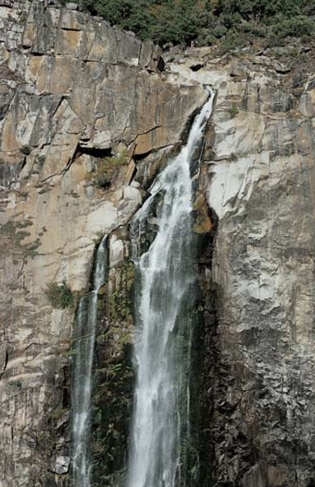
Feather Falls

waters of the Fall River drop 640 feet into a granitic gorge.